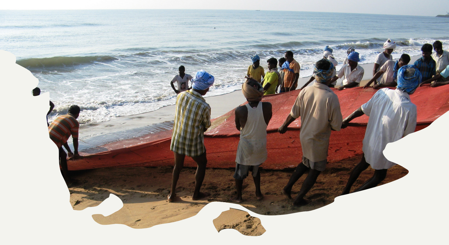
Future Earth Coasts has developed OUR COASTAL FUTURES as a new regional approach to: